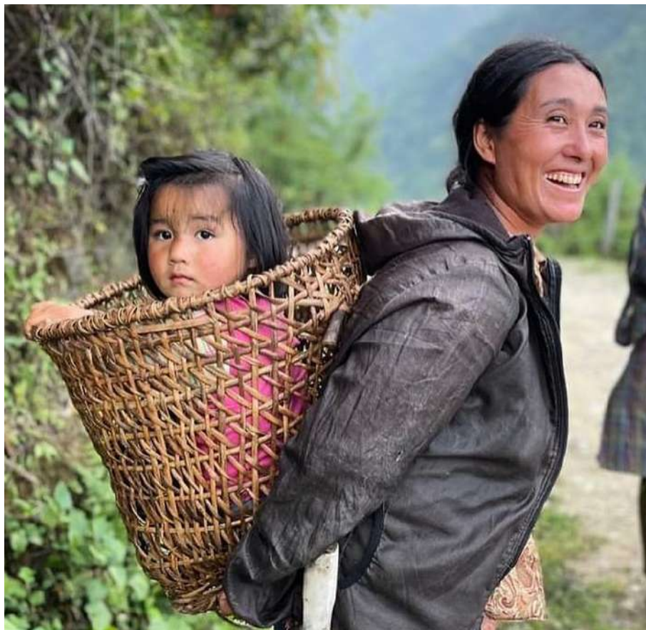
One of our beneficiaries.

Greetings from SAARC Development Fund (SDF). Welcome to SDF's E-Newsletter for the Second Quarter of 2022.