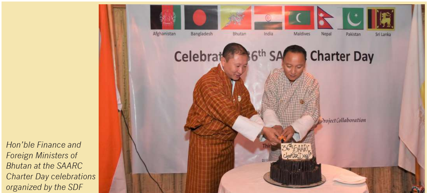
Hon'ble Finance and Foreign Ministers of Bhutan at the SAARC Charter Day celebrations organized by the SDF

Thimphu Bhutan, 8 December 2020 – The SAARC Development Fund (SDF) celebrated the 36th SAARC Charter Day in Thimphu Bhutan with partners on 8 December 2020.