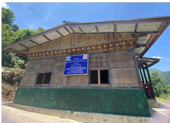
A Community Facility Centre (CFC) built with SDF support, which benefits to over 180 households