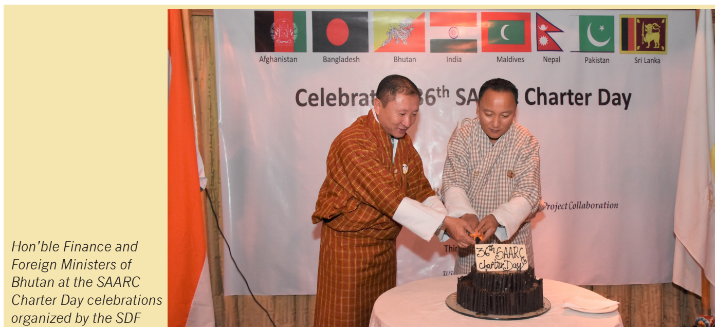
Hon'ble Finance and Foreign Ministers of Bhutan at the SAARC Charter Day celebrations organized by the SDF

Thimphu Bhutan, 8 December 2020 – The SAARC Development Fund (SDF) celebrated the 36th SAARC Charter Day in Thimphu Bhutan with partners on 8 December 2020.